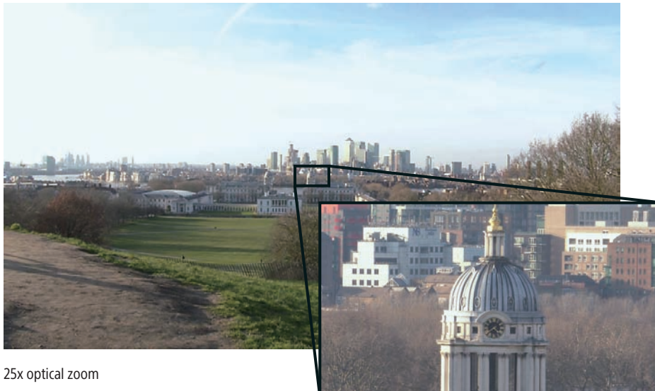
25x optical zoom